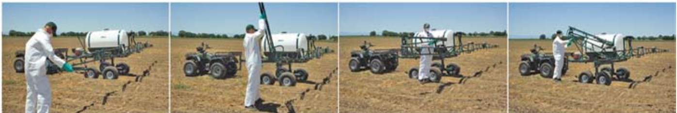
Transporting your Walking Beam sprayer's boom is easy with our folding Field boom.