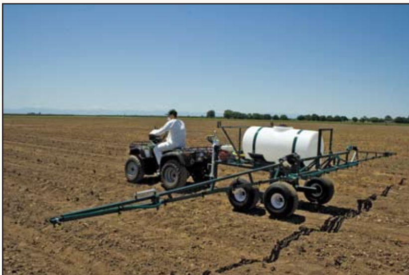
ATT-100 WB-H-4H-HC PKG-1

X102-000 $212.84 EA Walking beam drop axles, tires and wheels sold separately.